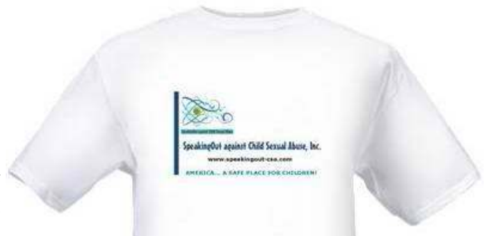
SpeakingOut T-Shirt Size Choices: S, M, L, XL, XXL